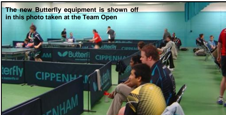
The new Butterfly equipment is shown off in this photo taken at the Team Open

places below Toin as they paradoxically lost to the same team in round four.