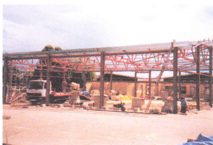
The building of the Centre - Summer 1996