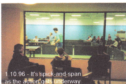
1.10.96 - It's spick-and-span as the action gets underway