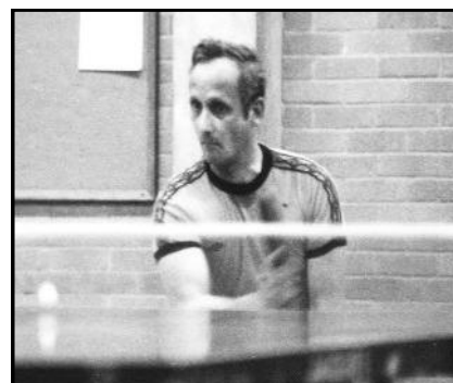
In action at the Slough Closed 1983