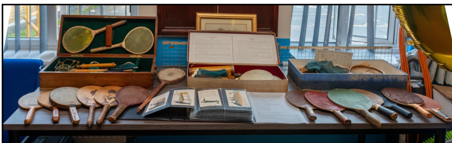
A small part of Graham's collection of historical table tennis artefacts is displayed

Link to the online 50th anniversary publication