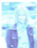
Then .. the Club's trip to Oostende in 1975