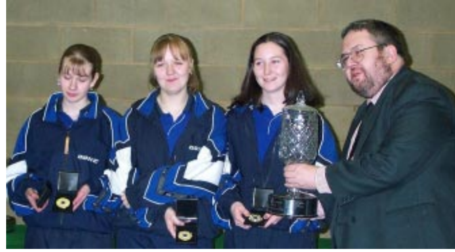
A reminder that the Cippenham girls' team are the Junior British League champions

Sep 1/2: I-Barnet; II-North Essex Dec 15/16: I-Saltash; II-Harlow Mar 16/17: I/II-Cippenham Apr 20: I-Barnet; 2-Harlow