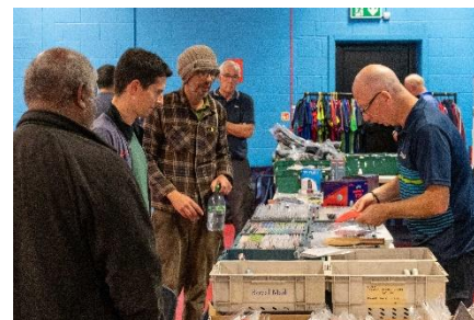
Table Tennis England: Senior British League (7) National Junior League (4) National Cadet League (4) Regional Qualification event (1) Level 1 coach education course (2) Bucks County TTA: County Championships sessions (2) Royal County of Berks TTA: Inter-Town Competition (1) Surrey County TTA: County Championships sessions (2) Maidenhead & DTTA: Maidenhead Closed Championships (1) Reading & DTTA: Reading Closed Championships (1) Individual Handicap Competition (1)

In addition, there was a midweek coaching day on behalf of Bucks during a school holiday.