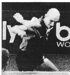
England number one Matthew Syed is another who rates Cippenham the best in the country!